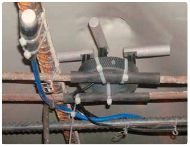
Figure 3. Recommended installation mounted on the reinforcement net. The CorroWatch probe is mounted in combination with an ERE-20 reference-electrode (blue cable).