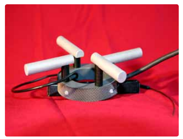
Figure 1. The CorroWatch probe